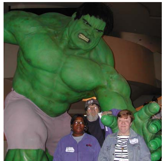
New Britain and West Hartford clients traveled to New York City to visit Madame Tussauds.