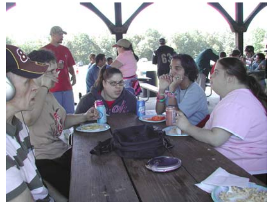
Bristol and Greater Waterbury clients enjoying a picnic in the park.