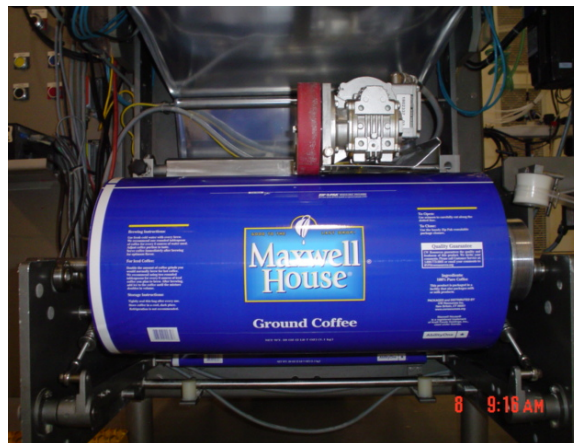
This roll of foil will be transformed into a resealable, 39 oz. pouch filled with coffee at CW's River Valley Products' plant in New Britain.