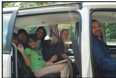
Riders leaving the Naugatuck CW after a day of work.